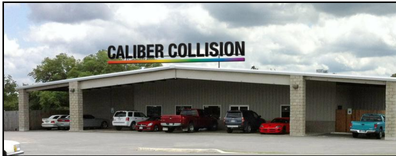
New Caliber Collision Boerne, TX Location

A photo of the new Boerne, Texas location is included below: