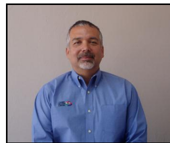
New Caliber Collision Northwest Oklahoma City, OK Location