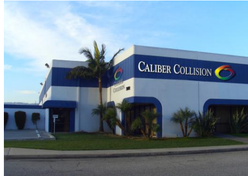
New Caliber Collision Torrance Center

A photo of the new Torrance location is included below: