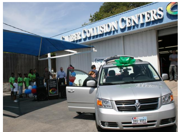
The 2010 Dodge Grand Van, donated by State Farm and refurbished by Caliber Collision, is the company's 8 th Recycled Rides gifting this year, with more planned at locations in Texas, California, Arizona and Nevada.